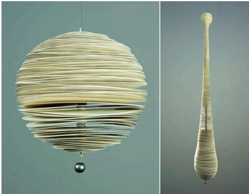
Some pieces in Jann Nunn's show at Mercury Twenty in Oakland

Jann Nunn has a show at Mercury Twenty Gallery in Oakland. Images follow: