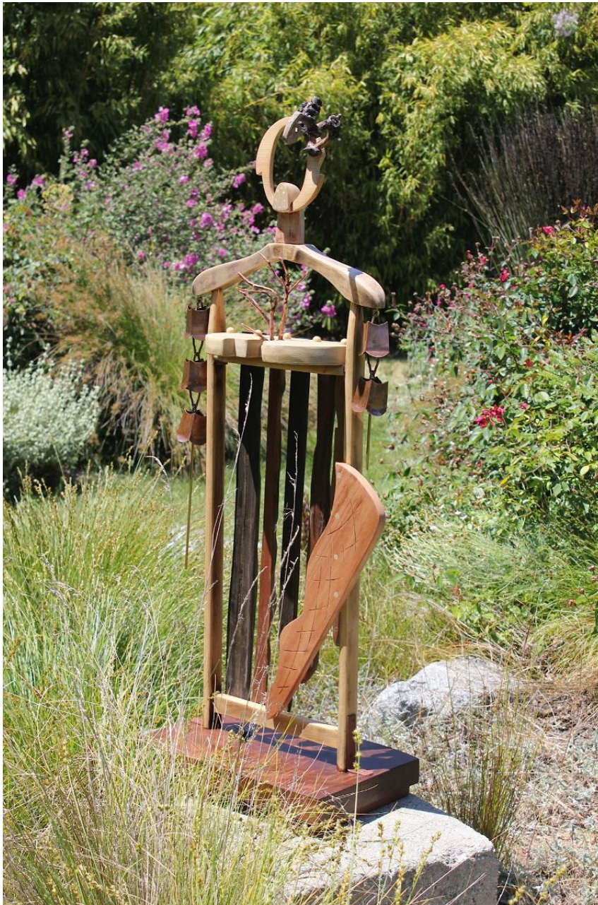
By Rosy Penhallow at Sierra Azul Nursery