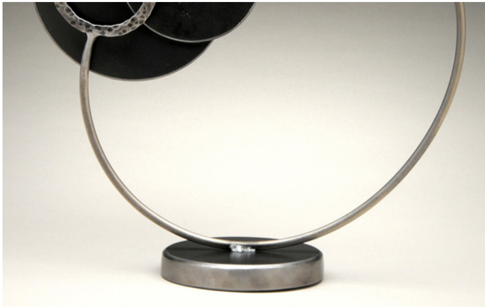
Reflection , by Rebecca Fox