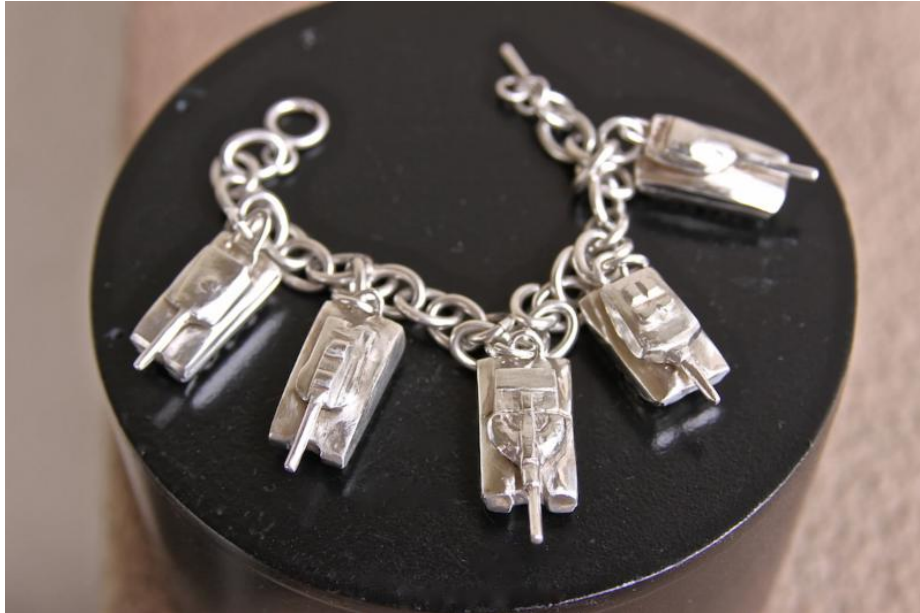
Tanks of the World , by Lynne Todaro