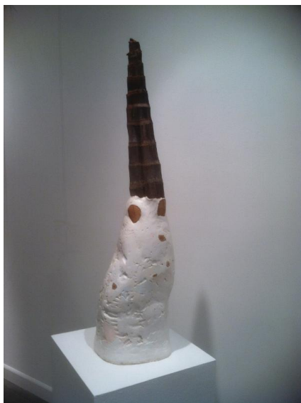
Cockamamie , by Lynne Todaro