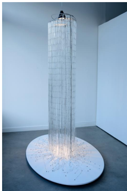
Breathing Space ,