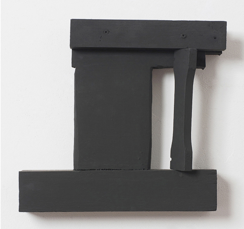
Knossos by Kornelios Grammenos

Catalogs for Magic Carpet Ride are available from Norfolk Press for $17.50 via this link .