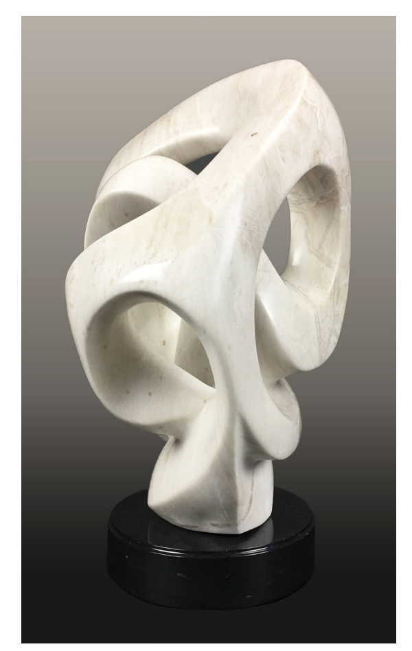
{\bf Marina~Smelik}, {\it Mystery~Within}