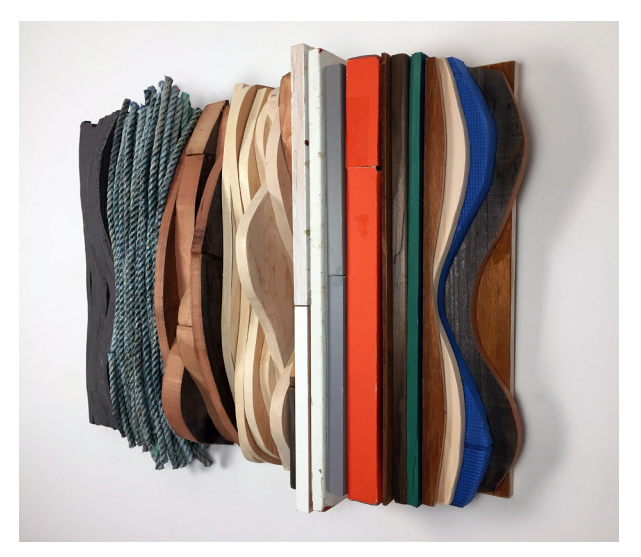
Barry Beach, From the Contested Terrain Series [End Game]